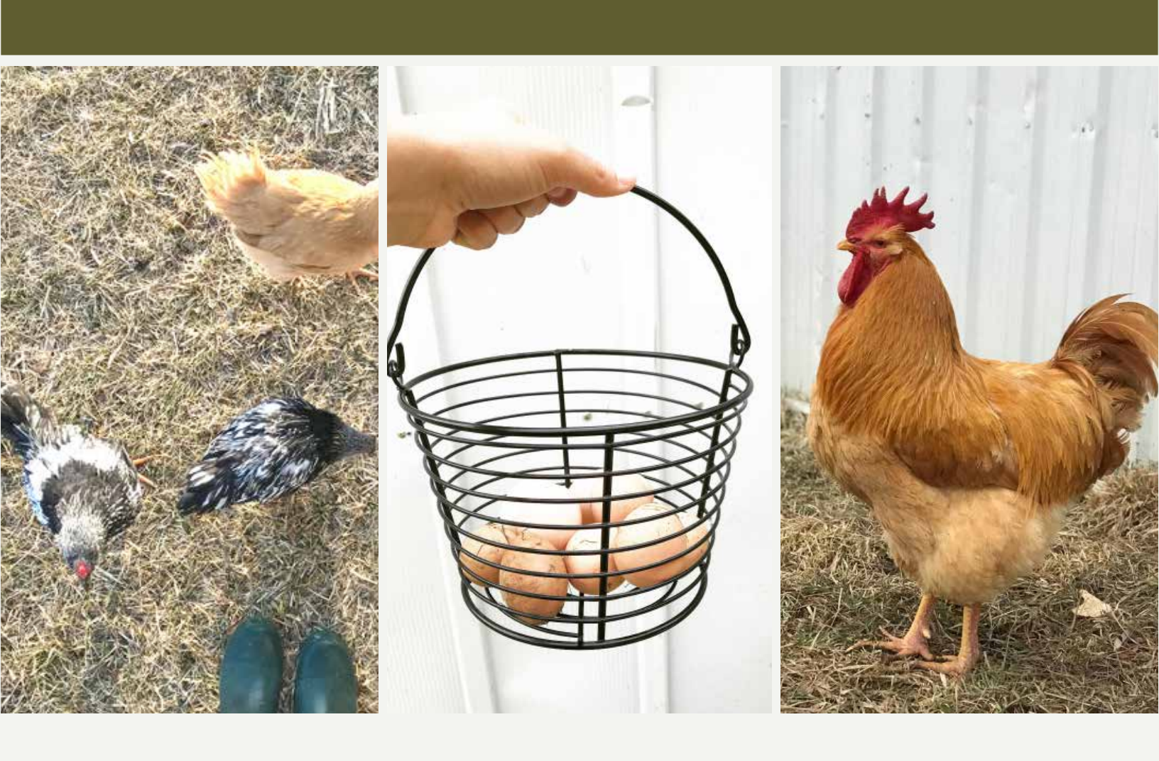
Abbagail @ Sage & Shepherd Farm