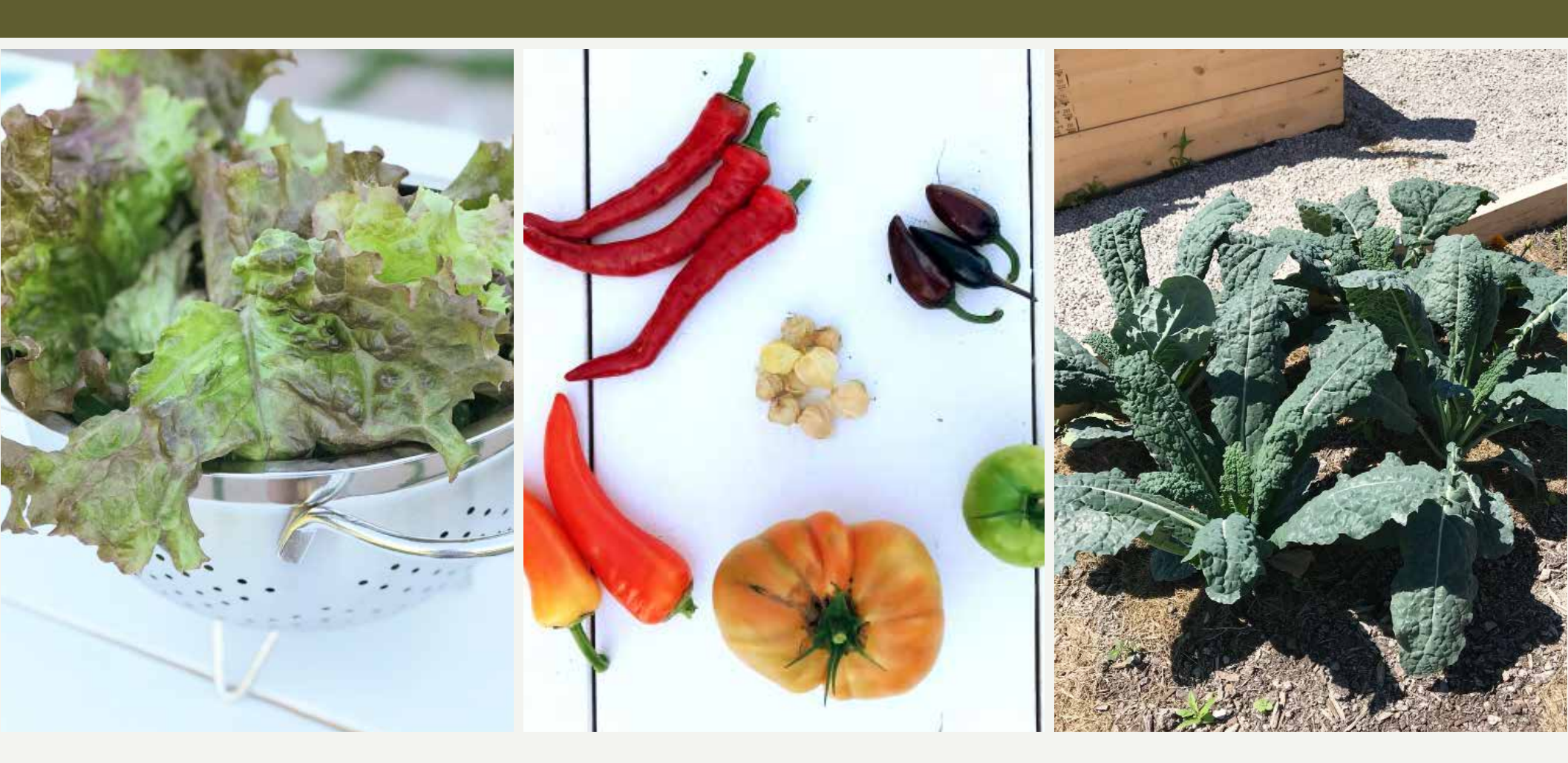
Abbagail @ Sage & Shepherd Farm